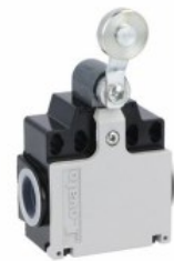
Roller lever plunger KNE