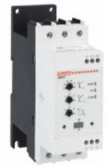
Soft starter advanced ADXNP Asynchronous three phase