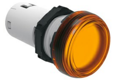
LED integrated monoblock pilot lights steady light LPML