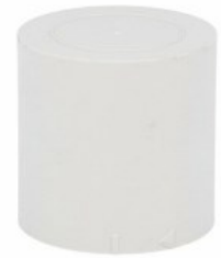
Signal tower Ø50mm/1.97" LTN50