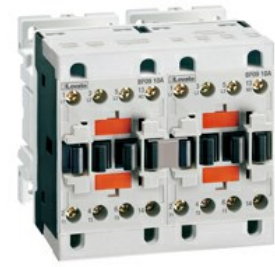
Reversing contactor BFA012