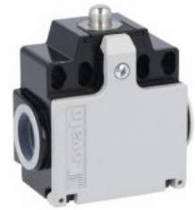
Top push rod plunger KNA