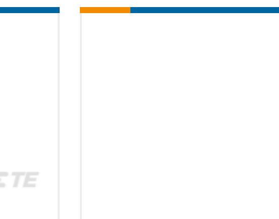
TE Part #1SNA166577R2000 CPT-2