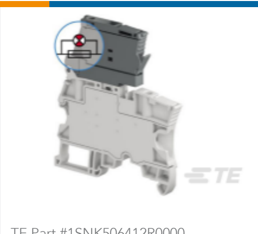
TE Part #1SNK506412R0000 ZS4-SF-R1