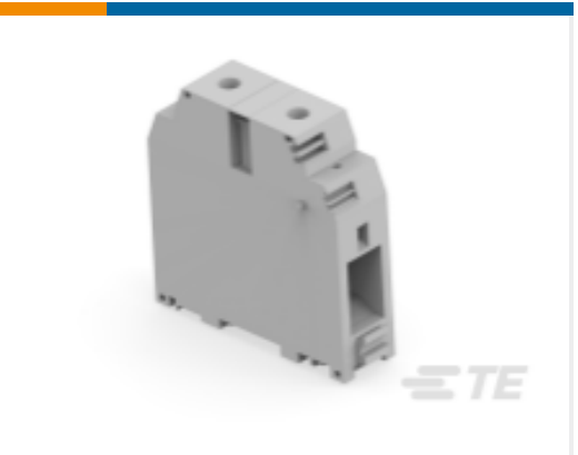
TE Part #1SNK531010R0000 ZS150