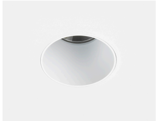
CODE: 1392038 FINISH: MATT WHITE

TO MAINTAIN THIS PRODUCT TO ITS BEST CONDITION, PLEASE VIEW OUR CARE AND CLEANING GUIDE ON THE SUPPORT SECTION OF THE ASTRO WEBSITE.