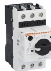
Motor protection circuit breaker SM1R