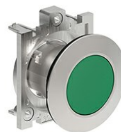
Pushbutton actuator, spring return LPFB10