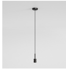
CODE: 1184020 FINISH: MATT BLACK