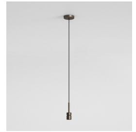
CODE: 1184021 FINISH: BRONZE

TO MAINTAIN THIS PRODUCT TO ITS BEST CONDITION, PLEASE VIEW OUR CARE AND CLEANING GUIDE ON THE SUPPORT SECTION OF THE ASTRO WEBSITE.