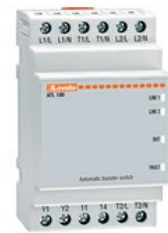
Automatic transfer switch controller for 2 power sources, single phase control, modular housing ATL100