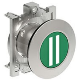
Pushbutton actuators, spring return, with symbol LPFB11