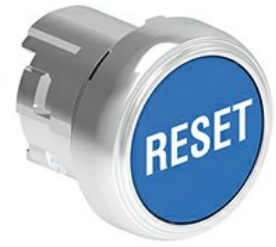
Pushbutton actuators, spring return, with symbol LPSB11