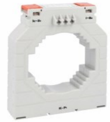
Current transformers DM4T1500 Solid-core