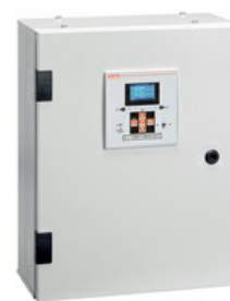
Enclosed automatic transfer switches ATS ATP