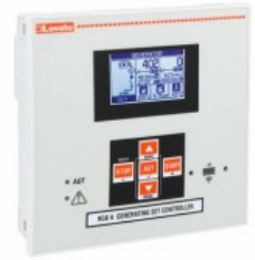
Automatic mains failure gen-set controllers RGK610