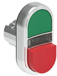
Double-touch actuators, spring return white indicator - One extended and one flush pushbuttons LPSBL72