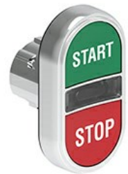
Double-touch actuators, spring return white indicator - Two flush pushbuttons LPSBL71