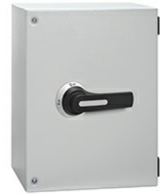
Enclosed changeover switch GLZM