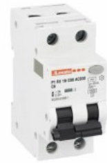
Residual current circuit breakers (RCCB) with overcurrent protection P1RE 1P+N 2 IEC