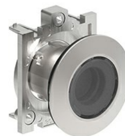
Pilot light head LPFL

Product designation Product type designation