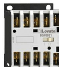
Auxiliary contactor BGF00