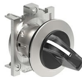
Illuminated selector switch actuator - 3 position LPFSL13