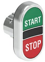
Double-touch actuators, spring return - two flush pushbuttons LPSB71