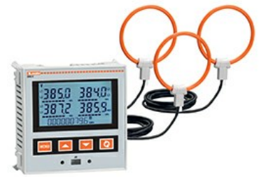
Flush-mount LCD multimeters. expandable DMG611 Three-phase + neutral