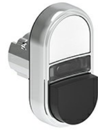
Double-touch actuators, spring return white indicator - One extended and one flush pushbuttons LPSBL72