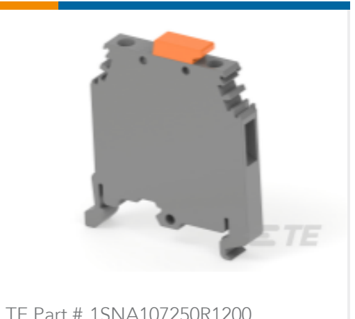
TE Part # 1SNA107250R1200 M4/6.SNB