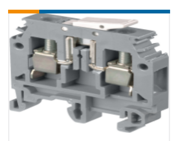
TE Part # 1SNA105055R2400 M6/8.SNB