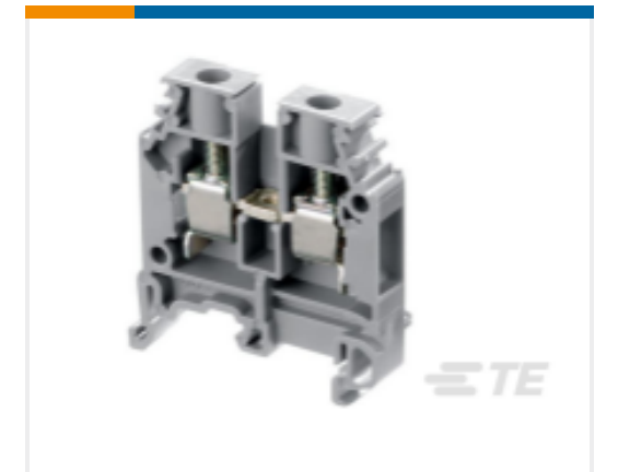
TE Part # 1SNA105118R2000 M6/8