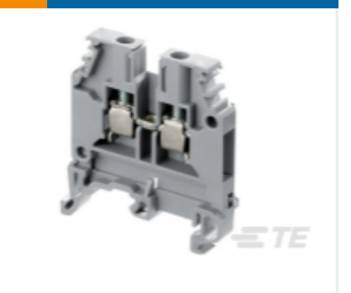
TE Part # 1SNA105116R1600 M4/6