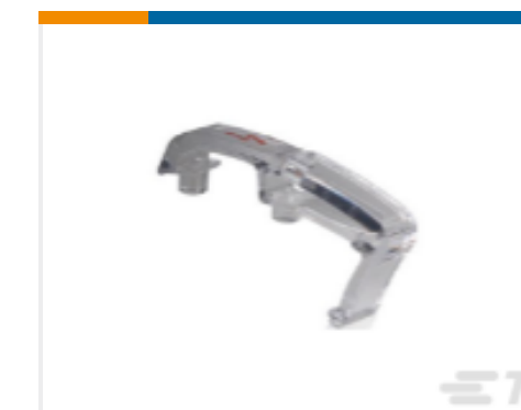
TE Part #1SNK900619R0000