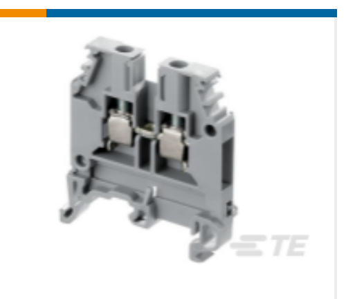
TE Part # 1SNA105002R2000 M4/6