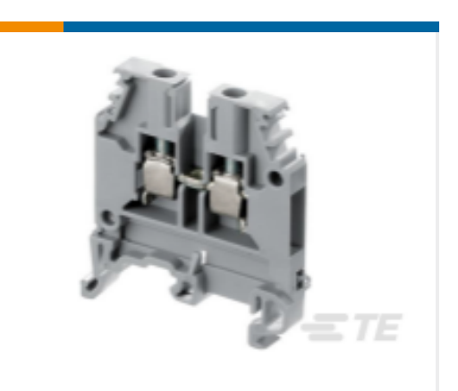
TE Part # 1SNA105031R1400 M4/6