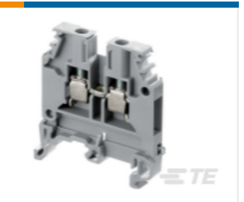
TE Part # 1SNA105032R1500 M4/6