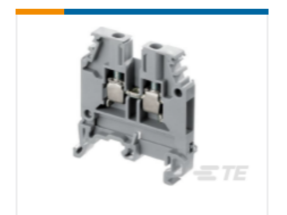
TE Part # 1SNA105209R1400 M4/6