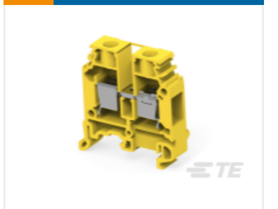
TE Part # 1SNA105120R2600 M10/10