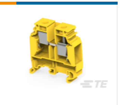
TE Part # 1SNA105129R2300 M16/12