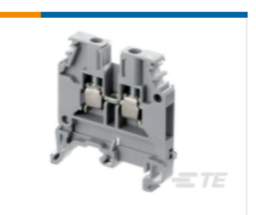
TE Part # 1SNA105075R2000 MA2.5/5