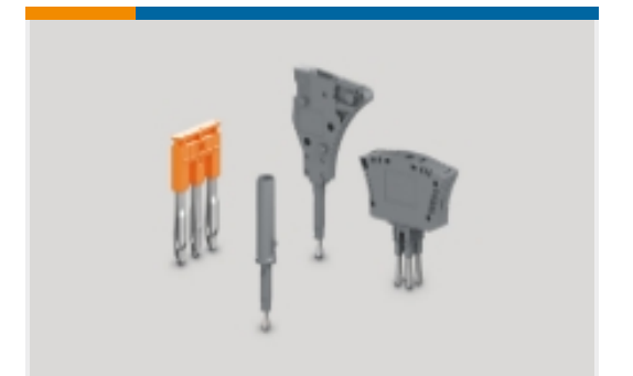
Terminal Block & Strip Conducting Accessories(26)