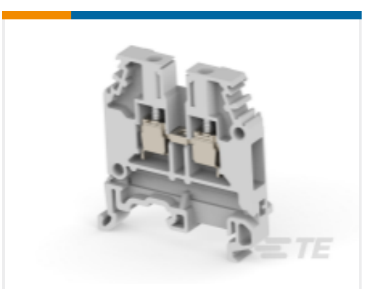
TE Part #1SNA115116R0700 M4/6