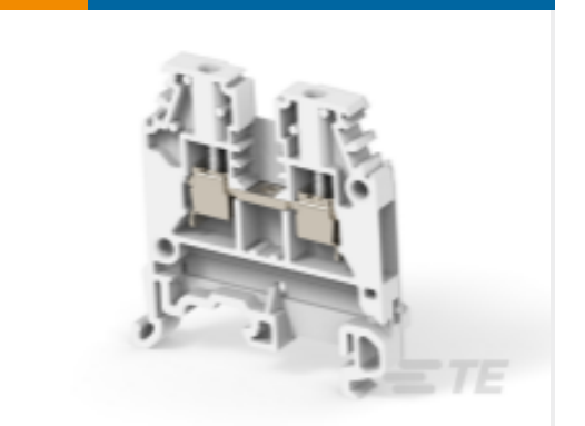
TE Part # 1SNA105052R2100 MA2.5/5