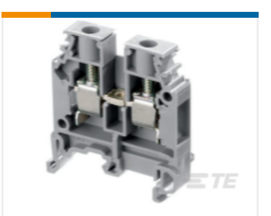
TE Part # 1SNA105004R2200 M6/8