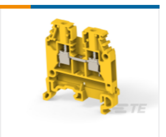
TE Part # 1SNA105486R1200 MA2.5/5