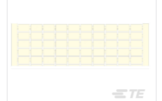
TE Part #1SNA233206R0000 RC610 5 (X100) HORIZONTAL