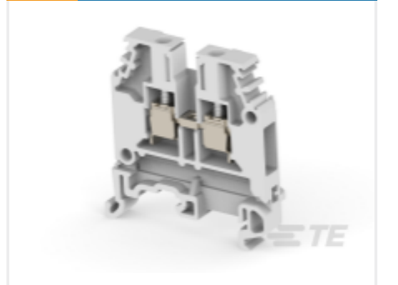
TE Part # 1SNA105051R2000 M4/6