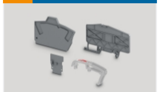
Terminal Block & Strip Insulating Accessories(14)