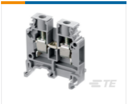
TE Part # 1SNA105128R2200 M6/8.1