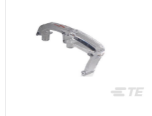
TE Part #1SNK900621R0000 PL10