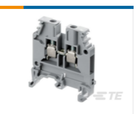
TE Part # 1SNA105077R2200 MA2.5/5