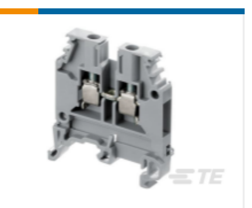
TE Part # 1SNA105001R2700 M4/6