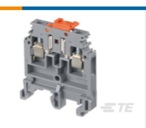
TE Part # 1SNA105053R2200 M4/6.SNB