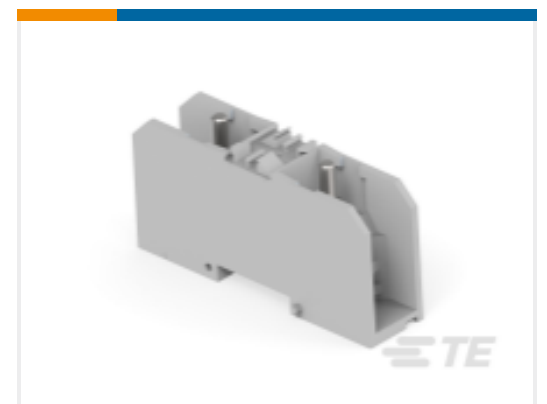
TE Part #1SNA190001R2000 D35/27.FF