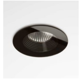
CODE: 1254016 FINISH: BLACK

TO MAINTAIN THIS PRODUCT TO ITS BEST CONDITION, PLEASE VIEW OUR CARE AND CLEANING GUIDE ON THE SUPPORT SECTION OF THE ASTRO WEBSITE.