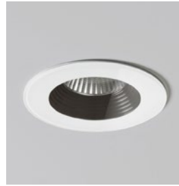
CODE: 1254013 FINISH: WHITE