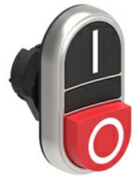
Double-touch actuators, spring return - One extended and one flush pushbuttons LPCB72