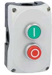
Grey control station LPZP2A8 complete with green flush pushbutton "I" LPCB1113 1NO and red extended pushbutton "O" LPCB2104 1NC LPZP2B8901