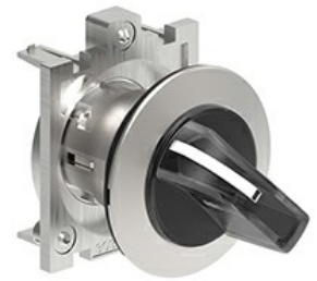
Illuminated selector switch actuator - 2 position LPFSL12