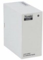
Level control relay for emptying function. Dual voltage. Plug-in version LV2E Emptying