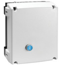
Empty enclosures M3RA