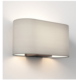
CODE: 1433004 FINISH: BRONZE