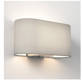
CODE: 1433008 FINISH: MATT NICKEL

TO MAINTAIN THIS PRODUCT TO ITS BEST CONDITION, PLEASE VIEW OUR CARE AND CLEANING GUIDE ON THE SUPPORT SECTION OF THE ASTRO WEBSITE.