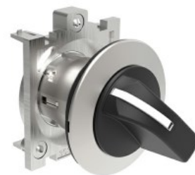
Selector switch actuators lever - 3 position LPFS13