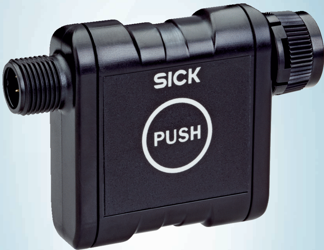
Pushbutton for laser alignment aid, M12, 8-pin