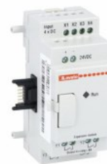
Micro PLC expansion module, 4 digital inputs + 4 relay outputs LRE08RD024