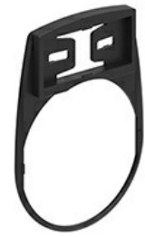
Label holder LPFXAU100

Product designation Product type designation