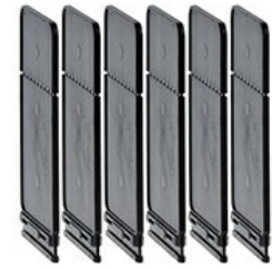
Phase barrier GLX9

Product designation Product type designation