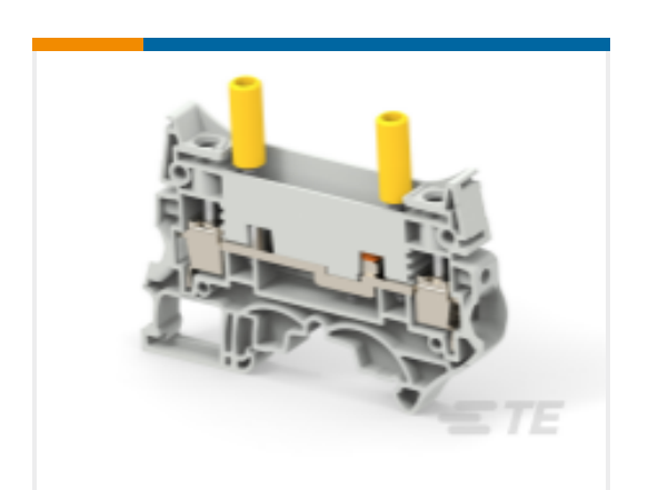
TE Part #1SNK508311R0000 ZS10-ST-T4