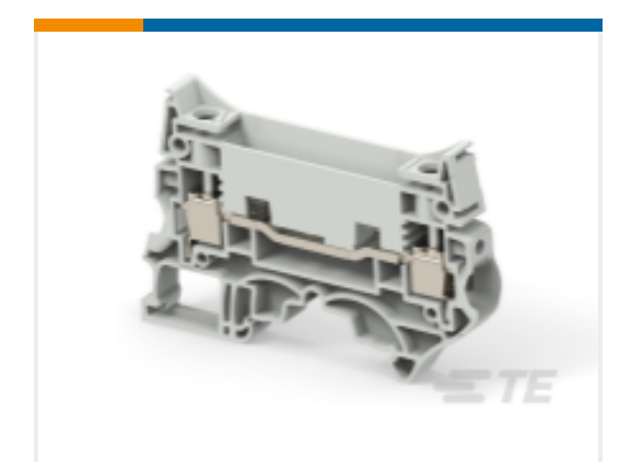
TE Part # 1SNK508011R0000 ZS10-R1