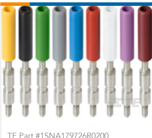
TE Part #1SNA179726R0200 AJS9