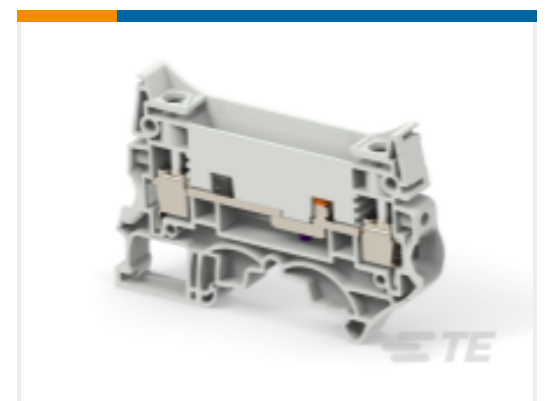
TE Part # 1SNK508310R0000 ZS10-ST