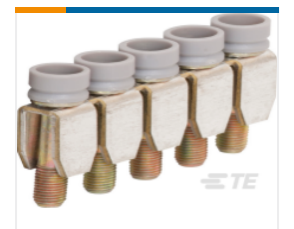
TE Part #1SNA176671R0000 BJMI8-4