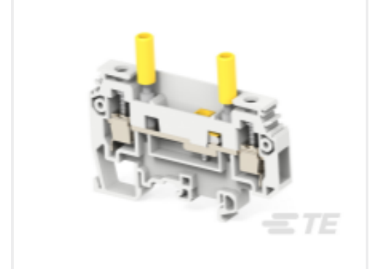
TE Part # 1SNA115971R1000 M6/8.ST1.IP20