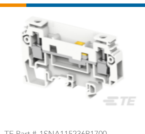
TE Part # 1SNA115236R1700 M6/8.ST