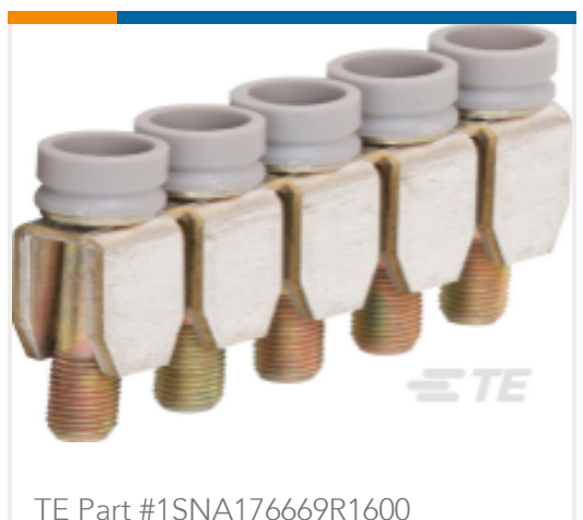
TE Part #1SNA176669R1600 BJMI8-2