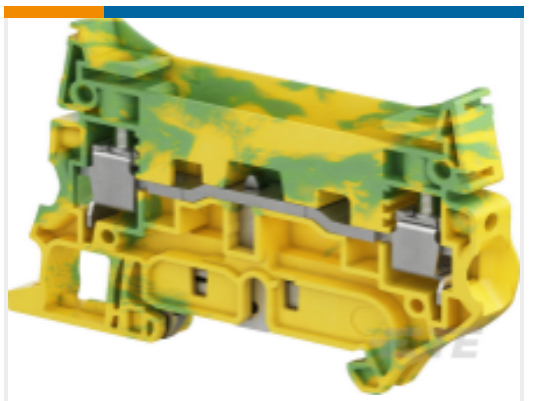
TE Part # 1SNK508151R0000 ZS10-PE-R1