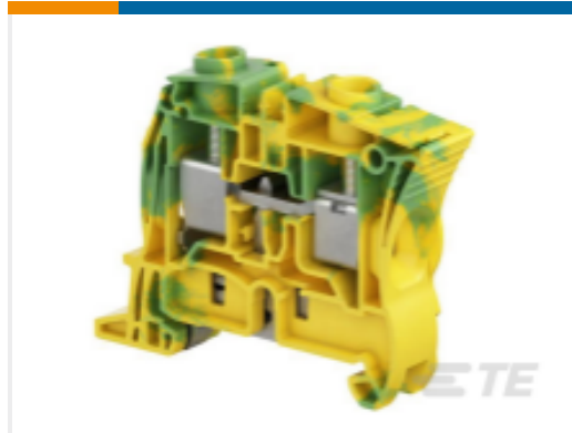
TE Part #1SNK512150R0000 ZS25-PE