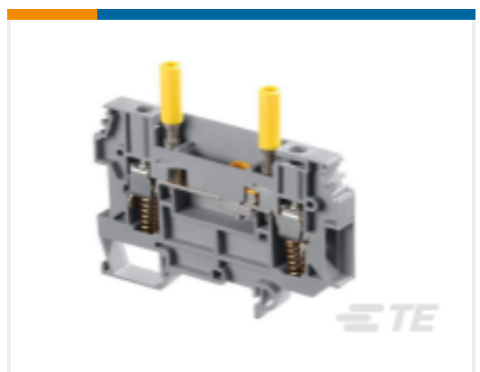
TE Part # 1SNA115831R0400 D6/8.ST1.RS.IP20