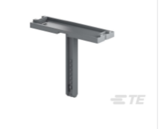
TE Part #1SNK900605R0000