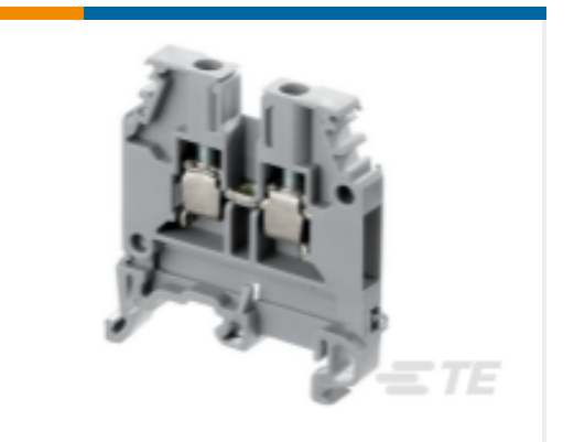
TE Part # 1SNA105002R2000 M4/6