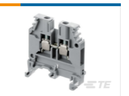
TE Part # 1SNA105209R1400 M4/6