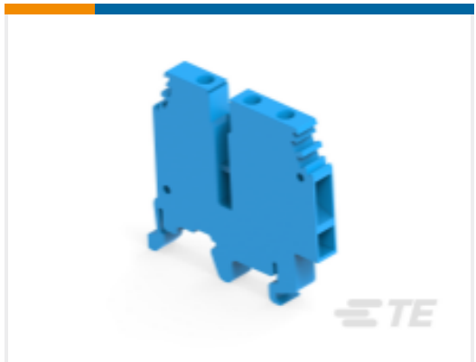
TE Part # 1SNA125468R2200 M4/6.3A.N