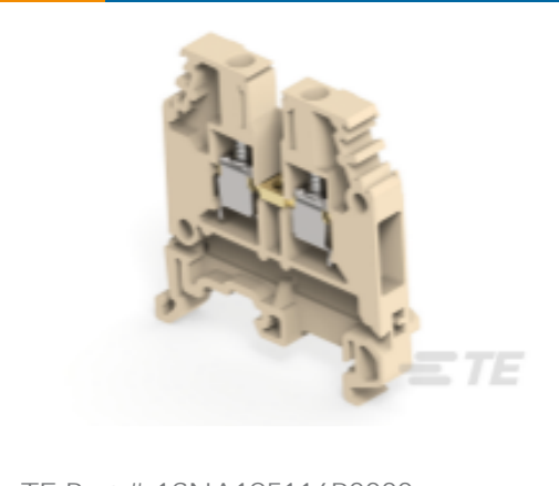
TE Part # 1SNA195116R0000 M4/6