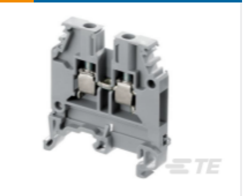
TE Part # 1SNA105116R1600 M4/6