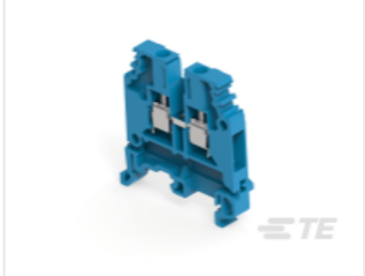
TE Part # 1SNA125116R0100 M4/6.N