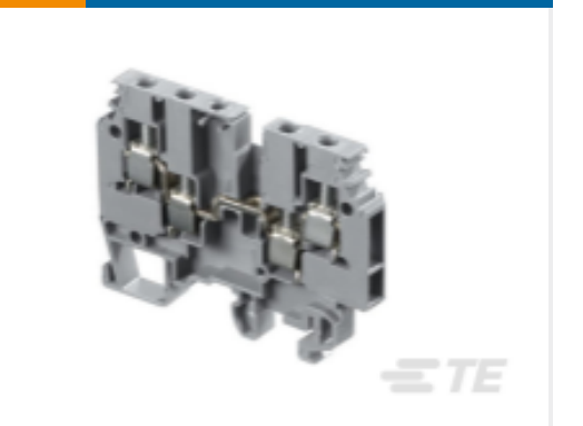
TE Part # 1SNA115479R2300 M4/6.4A