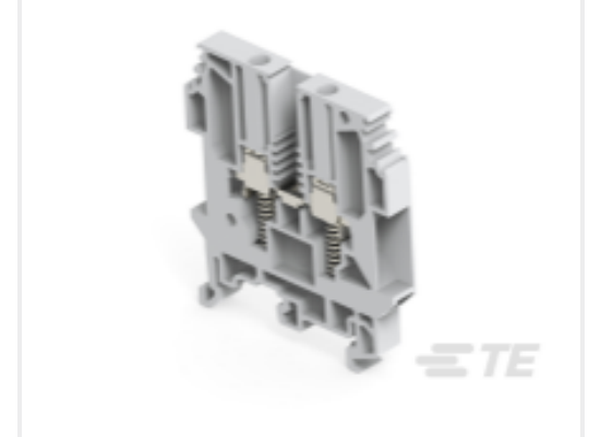
TE Part # 1SNA115930R1300 M4/6.RS