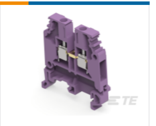
TE Part # 1SNA206404R0500 M4/6