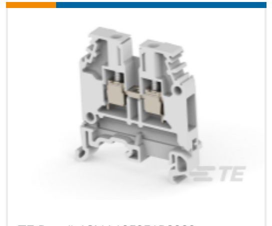
TE Part # 1SNA105051R2000 M4/6