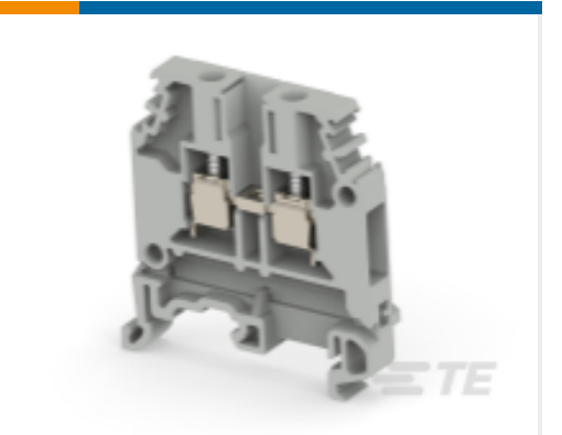
TE Part # 1SNA115259R0600 M4/6.1