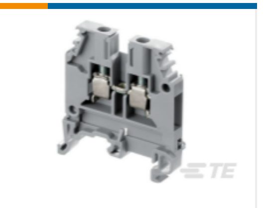
TE Part # 1SNA105031R1400 M4/6