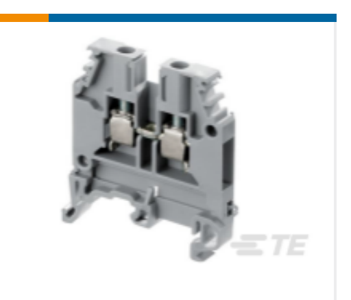
TE Part # 1SNA105032R1500 M4/6