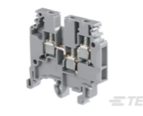
TE Part # 1SNA115468R2000 M4/6.3A