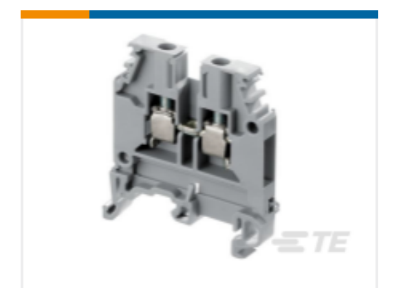
TE Part # 1SNA105001R2700 M4/6