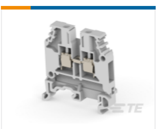
TE Part # 1SNA115116R0700 M4/6