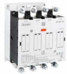
Power contactor BF195