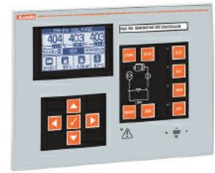
Automatic mains failure gen-set controllers RGK700