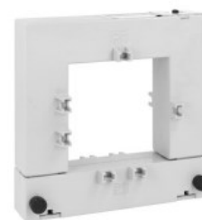
Current transformers DM2TA1250