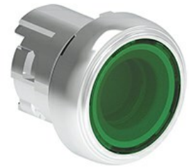
Illuminated button actuators, spring return - Flush LPSBL10