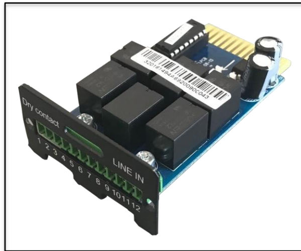
URC005 SmartZone UPS Relay Card.

The Panduit relay card is used to provide UPS internal status to the outside or control peripheral devices according to UPS status in the form of Form-C dry contacts. Simply connect the monitoring solution power source to the Common Source input and connect the monitoring solution to any or all the relay card's status outputs.