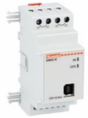
Expansion modules for modular products - communication port EXM1010