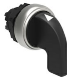
Selector switch actuators long lever - 3 position LPCS23