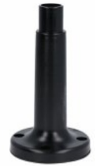
Fixing bases for signal tower and beacons - Horizontal surface mount 8LT7BP01